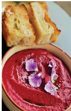
Beetroot Hummus with focaccia