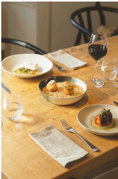
Halibut, Snacks and Hogget

The Cottage — 1 Royal Terrace Gardens, Edinburgh, EH7 5DX Open Thursday-Sunday thecottageedinburgh.com