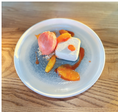
Semifreddo with Coconut & Blood Orange