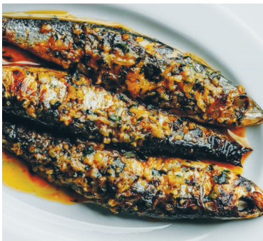
Roasted Sardines with Cate de Paris Butter