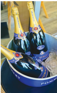
Lashings of Pommery