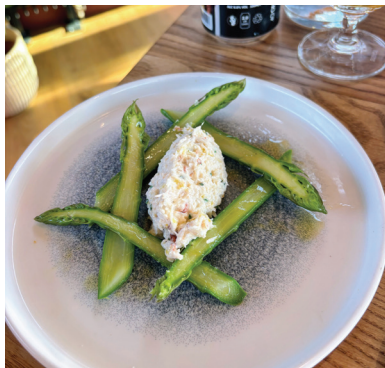
Wye Valley Asparagus with East Neuk Crab