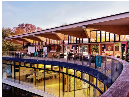
Garden View Deck & Bar