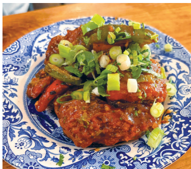
Crisp Chilli Paneer