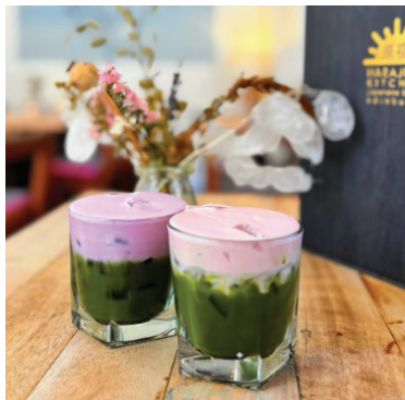
Ube & Strawberry Matcha