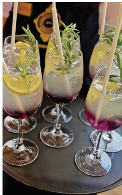
A cheeky spritz, don't mind if we do!