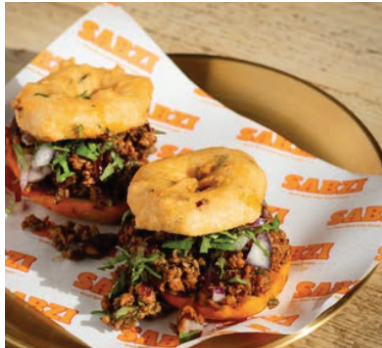
Keema Medu Vada