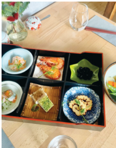
Kikkaju Bomb Box

Harajuku Kitchen Bistro — 10 Gillespie Place, Edinburgh EH10 4HS 0131 285 8182 harajukukitchen.co.uk