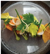
Ham Hock Terrine

Generosity of portions is repeated in a thick slice of Ham Hock Terrine which is firm yet soft and highly textured, mustardy, caper-y and savoury, topped with quail egg, fresh herb greens, potato crisp and set on a parsley emulsion. What's not to love?