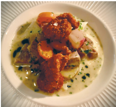
Braised Lamb with Sweetbreads