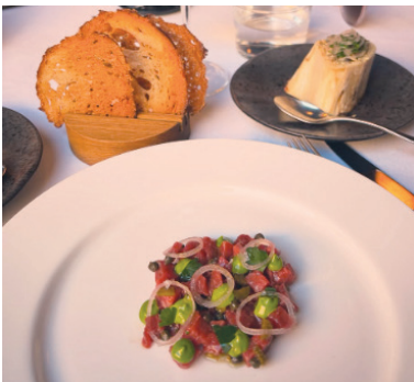
Steak Tartare with Salted Bone Marrow and Sourdough