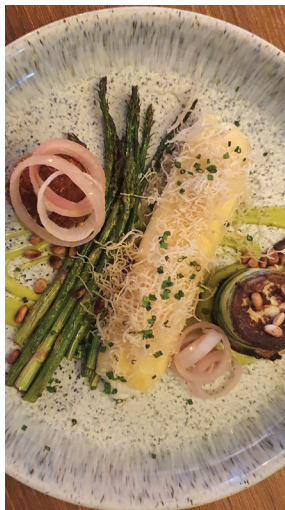
Wild Garlic and Saffron Cannellini