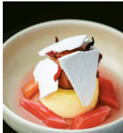
Rhubarb Vanilla Parfait