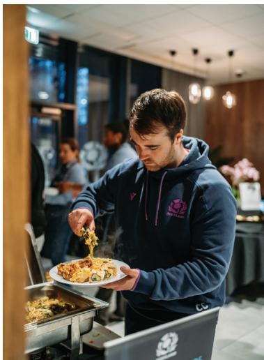
The Scotland Rugby team fell in love with Japanese food at the 2019 World Cup