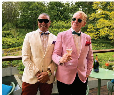
The Social Bitches: Best dressed, yet again.

Fortunately, the friendly, brilliantly attentive staff can spot an empty champagne flute at fifty paces. Which alongside the scenery, food and libations, gives this venue a definite five stars.