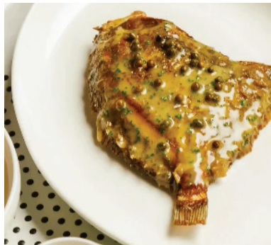
John Dory with Miso Sauce and Green Peppercorn