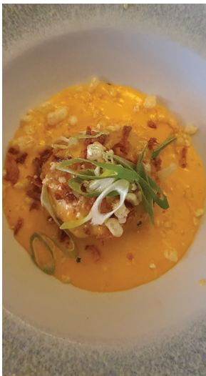
Gochujang Ham Hook Croquette with apricot and miso